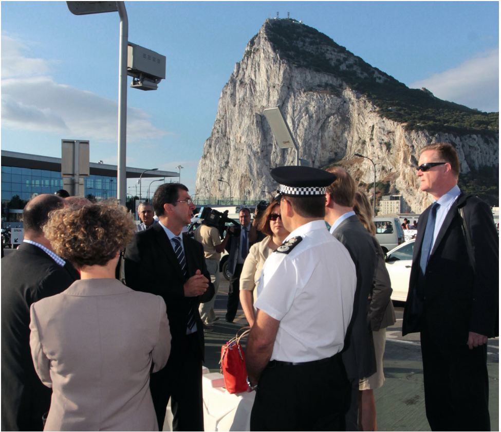
European Commission visiting the frontier 2nd July 2014

Our membership of the EU has brought many challenges but it has also been a platform to defend the rights derived from that membership such as freedom of movement for people and services across Europe and through the frontier. When, in 2013, Spain tried to create deliberately slow and intrusive checks, the EU responded to the call from thousands of citizens who formally petitioned.